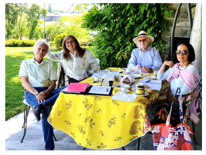
Your committee at work ... with coffee, tea and banana cake

On Tuesday your committee met to prepare the program for the coming months and next year. The first item was to find a new date for the missed Annual General Meeting we had scheduled in May. On the agenda were the reports of the committee, membership and treasury and the future of ICL, all items that are important and must not be missed.